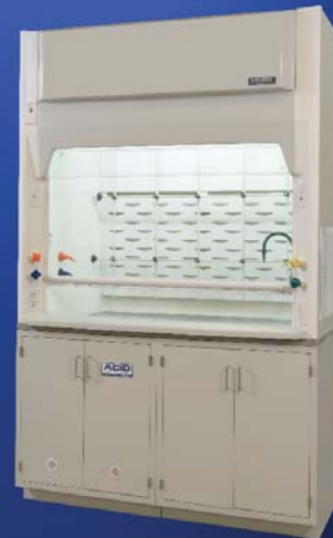
UniFlow SE AireStream High Performance Energy Efficient Laboratory Fume Hood