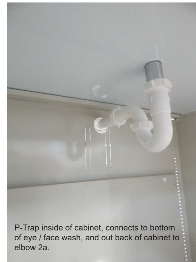
P-Trap inside of cabinet, connects to bottom of eye / face wash, and out back of cabinet to elbow 2a.