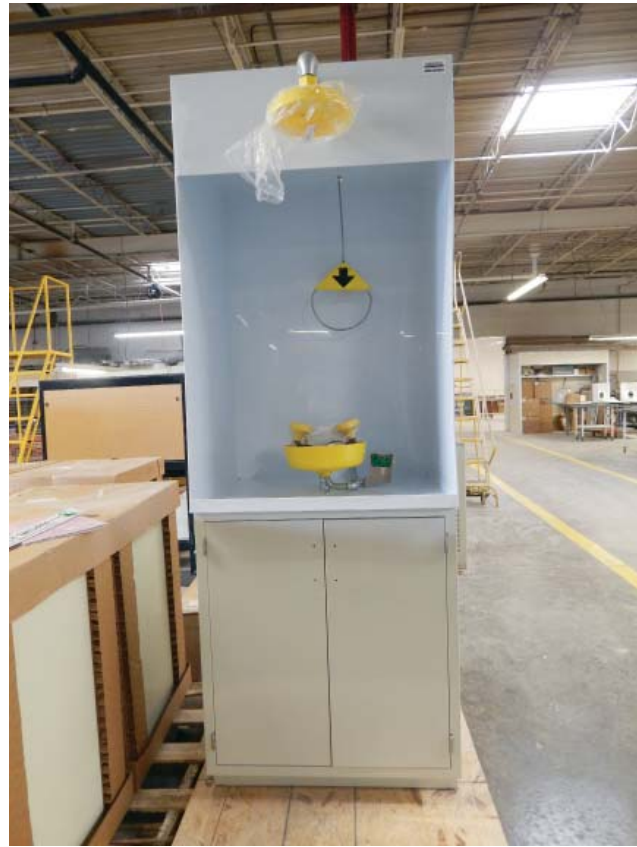
Front of safety station