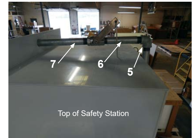
Top of Safety Station