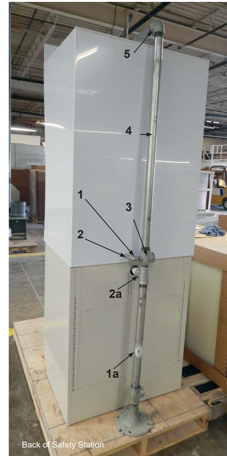
Back of Safety Station

Plumbing on safety station is numbered, for re-assembly