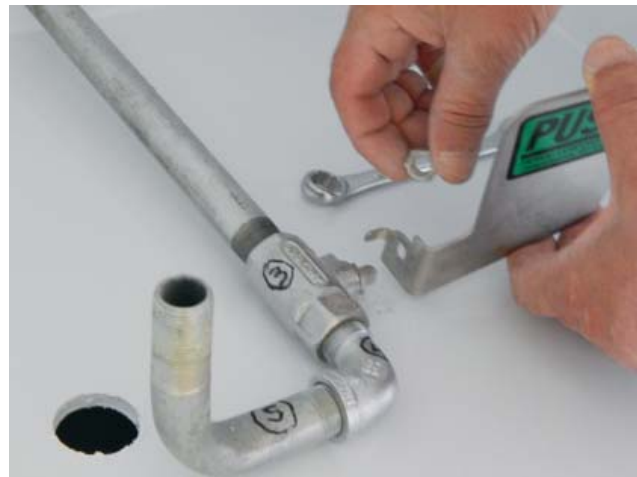
Install Push pull handle onto valve #3 using nut provided