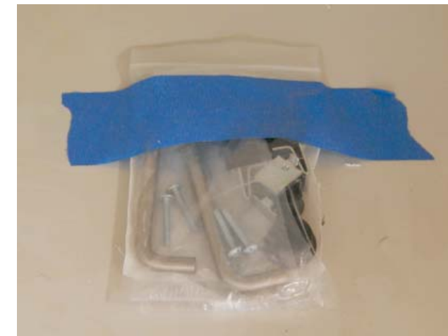
Hardware for cabinet is located inside bottom of cabinet, includes door pulls, and shelf supports.