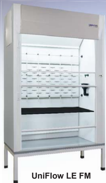
UniFlow LE FM