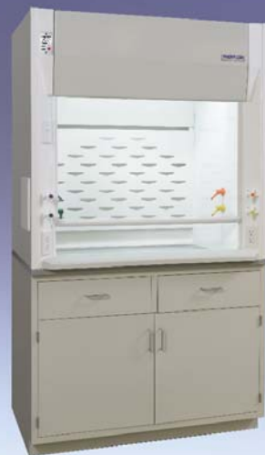
UniFlow LE AirStream