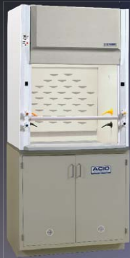
UniFlow CE AirStream