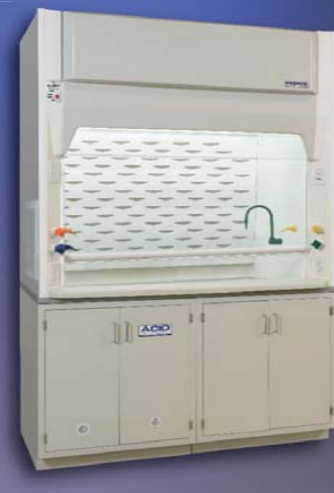
UniFlow SE AireStream High Performance Energy Efficient Laboratory Fume Hoods