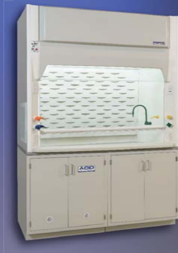
UniFlow SE AirStream High Performance Energy Efficient Laboratory Fume Hoods