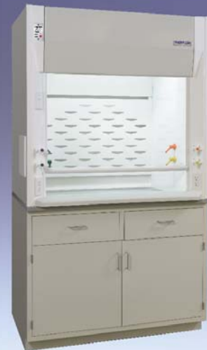
UniFlow LE AirStream