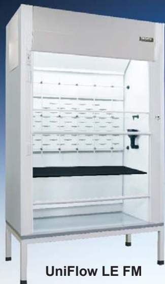
UniFlow LE FM