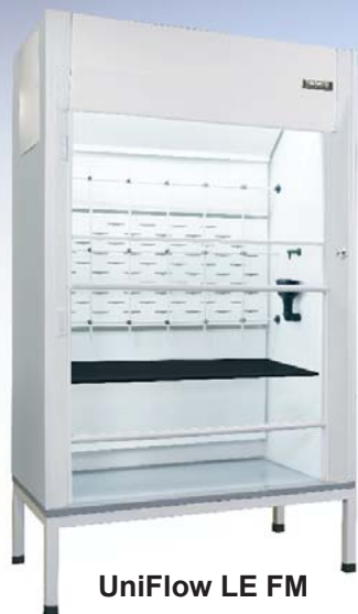
UniFlow LE FM