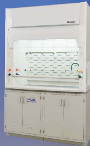
UniFlow SE AireStream High Performance Energy Efficient Laboratory Fume Hoods