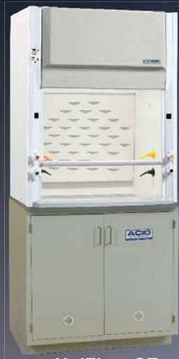
UniFlow CE AirStream