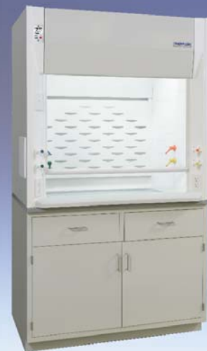
UniFlow LE AirStream