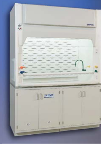
UniFlow SE AireStream High Performance Energy Efficient Laboratory Fume Hoods