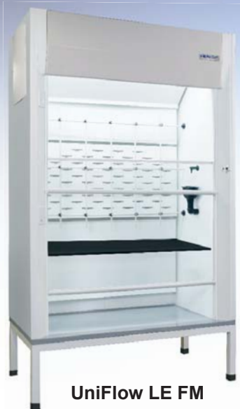
UniFlow LE FM