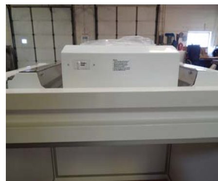
Filter Unit front view

To keep your unit clean and new looking, dust with a dry cloth or wipe with a damp cloth. Do not use abrasives or harsh detergents.