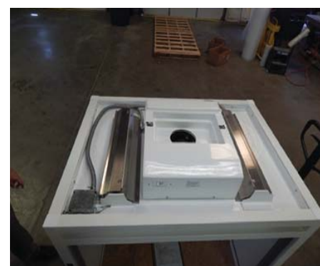
Filter Unit top view, with filter removed