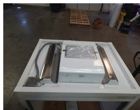
Filter Unit top view, with filter installed