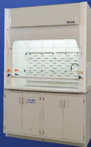
UniFlow SE AireStream High Performance Energy Efficient Laboratory Fume Hoods