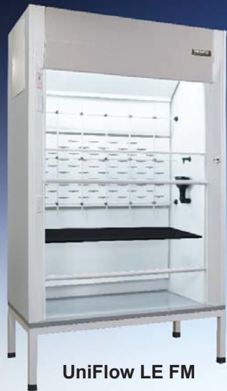
UniFlow LE FM